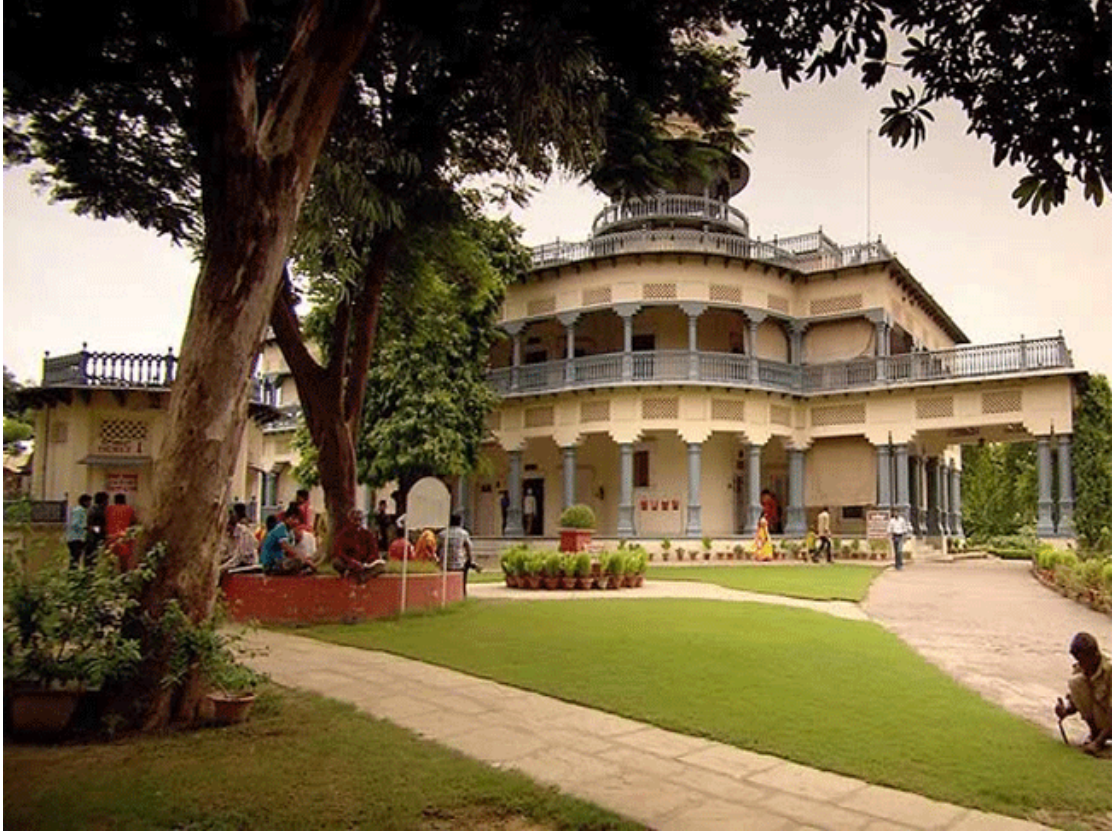
Photo: Anand Bhawan, Allahabad